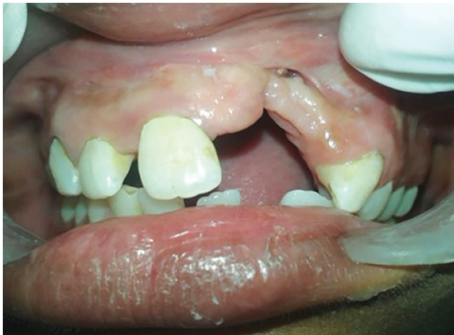
Fig. 1: Patient examination for the orofacial defect extensions