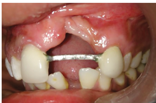
Fig. 5: Retainers in place