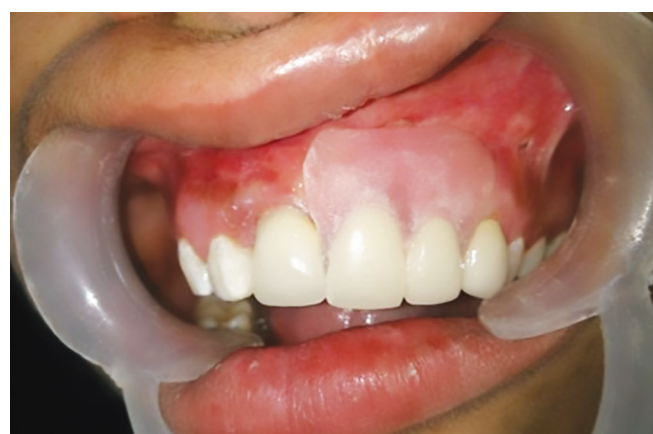
Fig. 6: Prosthesis with fixed and removable components in mouth

inevitable sequel of the surgery, the prosthetic rehabilitation with obturator is an auxiliary or complementary treatment to surgical treatments.