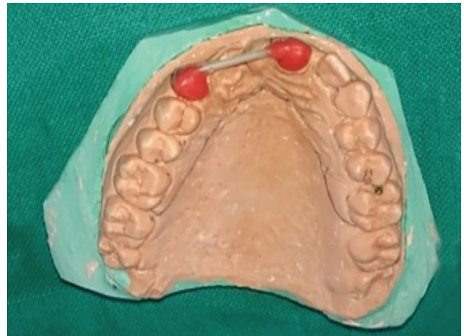
Fig. 2: Coffee straw cast attached to the wax pattern