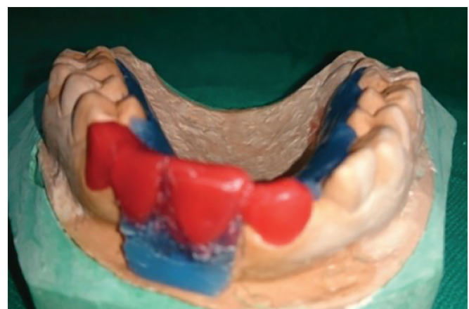
Fig. 3: Waxed-up fixed and removable dentures to be cast separately

Considering her age, an obturator attached to the Andrew's bridge (fixed removable) was planned. Intentional endodontic treatment was done with tooth # 11, and tooth preparation for porcelain-fused-to-metal (PFM) crowns was completed for both the abutment teeth 11 and 23. Impression was recorded with rubber base material and was checked for the accuracy (Fig. 2). Wax copings were prepared on the abutment teeth, and the plastic coffee stirrer was adapted for fabrication of bar as per the antero-posterior and superoinferior availability of space to accommodate the artificial teeth and the retentive components (Fig. 3). The stirrer and the copings were cast together in Ni-Cr-Co alloy, and a finished and polished assembly was tried in mouth and checked for accuracy. After the undercut block out, the position of the riders and the smooth slide of the housing were checked (Fig. 4). Missing central and lateral incisors were planned to be replaced with PFM teeth rather than conventional acrylic teeth. A waxed-up denture base was prepared extending to the hard palate 8