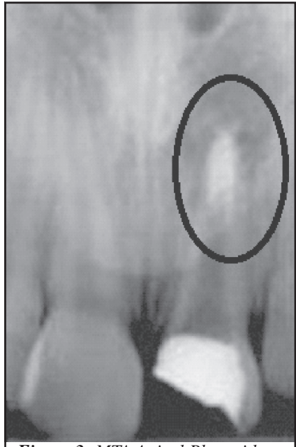
Figure 3: MTA Apical Plug with open Apex

hard tissue and the potential of a better biological seal and considered it as an effec as an alternative to calcium hydroxide apexication for immature permanent teeth. Furthermore, the potential for fractures of immature teeth with thin roots is reduced, as a bonded core can be placed immediately within the root canal (33).