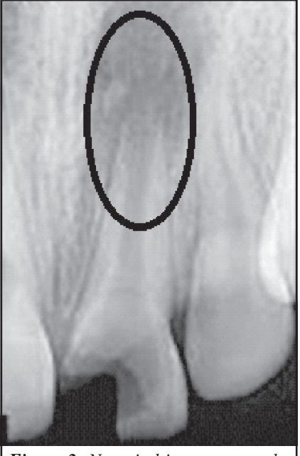
Figure 2: Non vital immature tooth

Witherspoon and Ham asserted that MTA provides scaffolding for the formation of