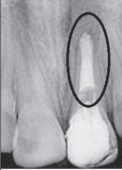
Figure 4: Obturation after MTA apexification