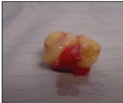
Figure 3: Photograph Of Clinical Specimen Clearly Showing The Odontome Fused To The Wisdom Tooth

occurring in the bud stage of development where excessive numbers of initiation leads to the formation of uncoordinated cells crowded into one area. On the one hand, a lack of initiation leads to absence of teeth whilst on the other hand excessive growth of the dental lamina which in turn results in additional tooth germs budding off leads to the formation of additional teeth. The exact cause of odontomes is not known but trauma and infection have been suggested as possible aetiological factors (1). These hamartomatous malformations which consist of enamel and dentine with a variable amount of cementum and pulp tissue are classified as compound and complex according to the WHO classification with a variant hybrid sometimes being included when there are elements of both present (2). The main difference between the two types is that the compound odontome consists of toothlets which can easily be diagnosed from radiographs, whilst the complex odontome requires histological confirmation because the calcified structure bears no clinical resemblance to dental structures appearing as a mass of calcified tissue (3).