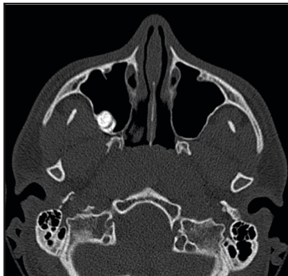
Figure 2: Axial Ct Scan Showing The Wisdom Tooth And Associated Mass

occurring in the bud stage of development where excessive numbers of initiation leads to the formation of uncoordinated cells crowded into one area. On the one hand, a lack of initiation leads to absence of teeth whilst on the other hand excessive growth of the dental lamina which in turn results in additional tooth germs budding off leads to the formation of additional teeth. The exact cause of odontomes is not known but trauma and infection have been suggested as possible aetiological factors (1). These hamartomatous malformations which consist of enamel and dentine with a variable amount of cementum and pulp tissue are classified as compound and complex according to the WHO classification with a variant hybrid sometimes being included when there are elements of both present (2). The main difference between the two types is that the compound odontome consists of toothlets which can easily be diagnosed from radiographs, whilst the complex odontome requires histological confirmation because the calcified structure bears no clinical resemblance to dental structures appearing as a mass of calcified tissue (3).